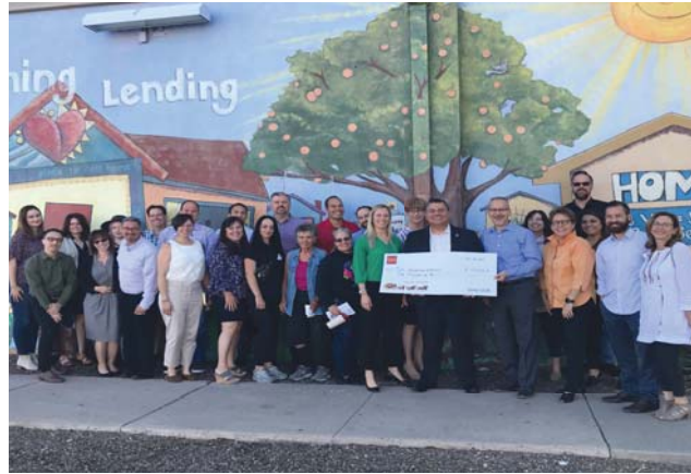
Wells Fargo presents a check to Trellis and The McDowell Road Revitalization Committee for its work along the Miracle Mile .