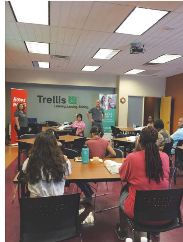
Trellis clients participate in one of Trellis' Financial Coaching classes.