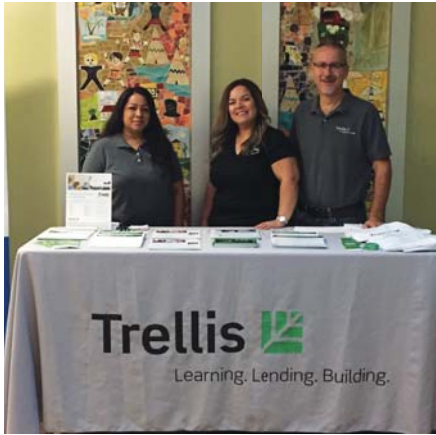
Staff members at an outreach event help raise awareness of Trellis programs and services.